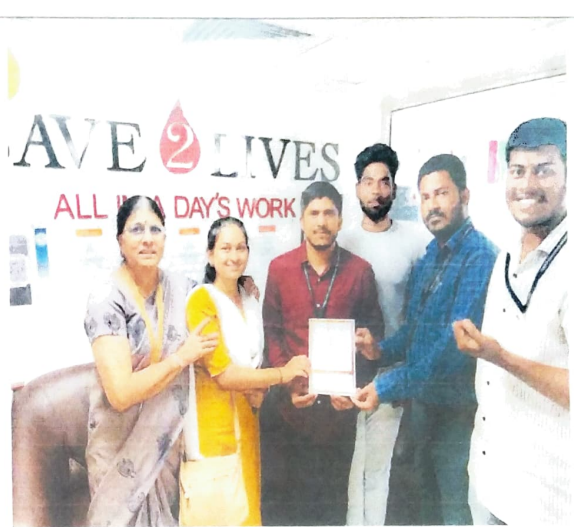
Blood Donation Certificate