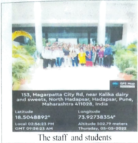
The staff and students