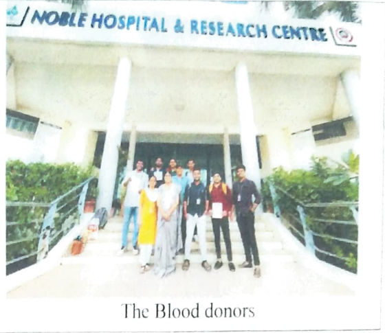
The Blood donors