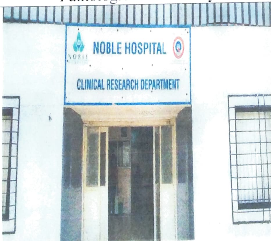
Clinical Research Centre